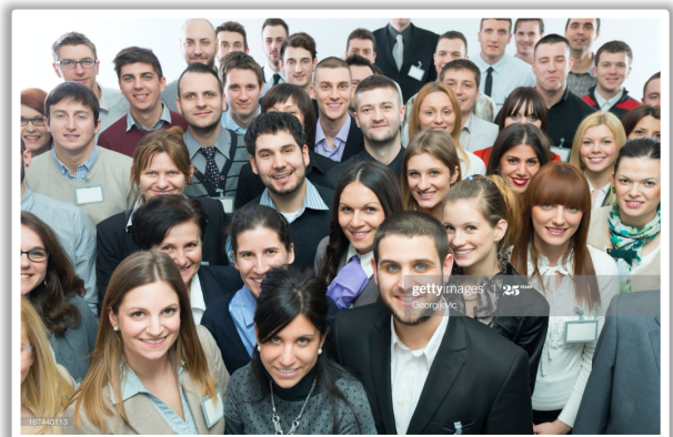
Overseas bulk recruitment & Selection