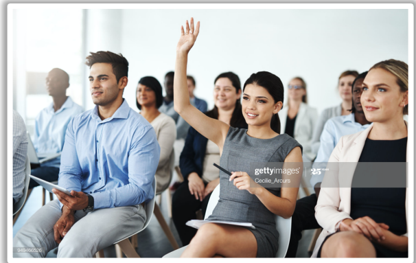
Executive Search & Selection

Why not give us a try? Contact us today to speak with a member of our specialist team and discuss your business needs with us.